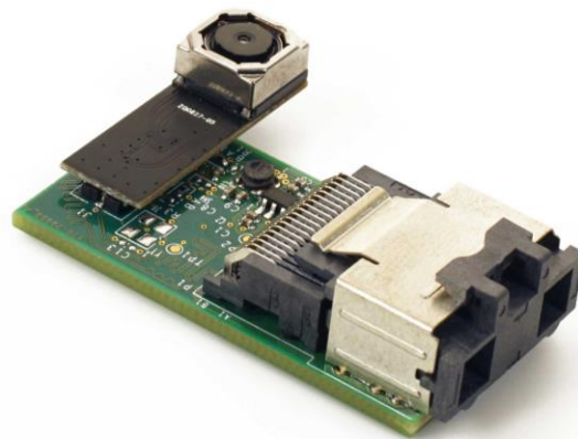
Figure 1. MINISASTOCSI accessory card